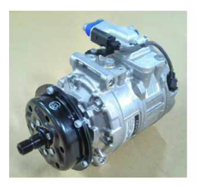
DCP32006 (without kit)