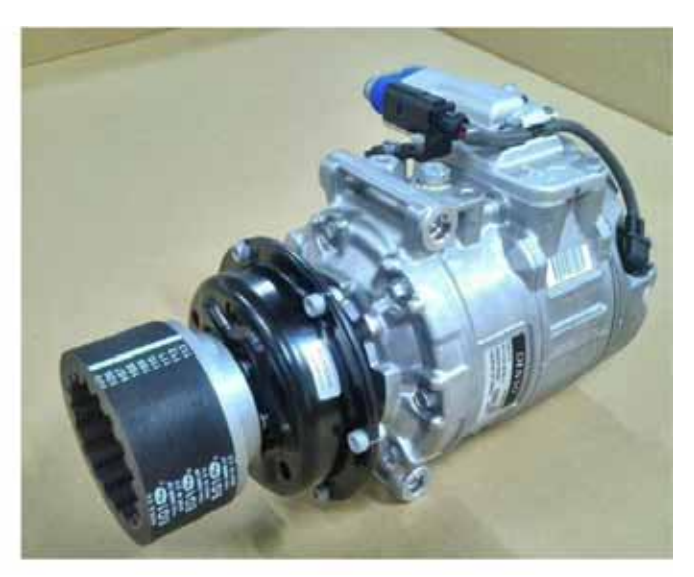
DCP32006K (with kit)