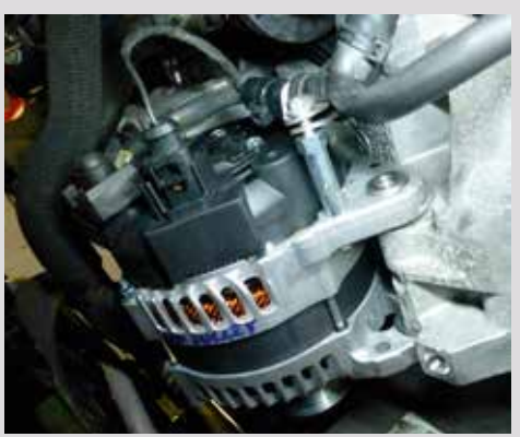
Battery cable and connector wiring are fitted without any problem