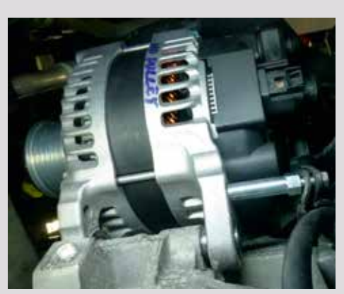
Denso compact alternator is easy to install