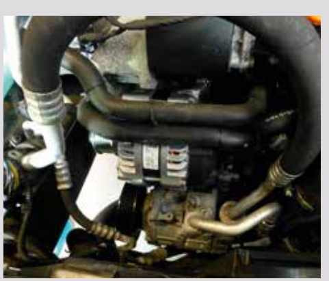
Denso compact alternator is easy to install