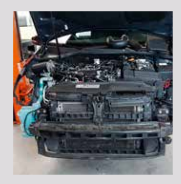
No sufficient space to remove old alternator due to big size