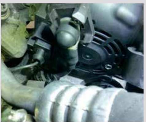
Battery cable and connector wiring are fitted without any problem